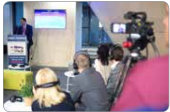
VIDEO PAPER STAGE