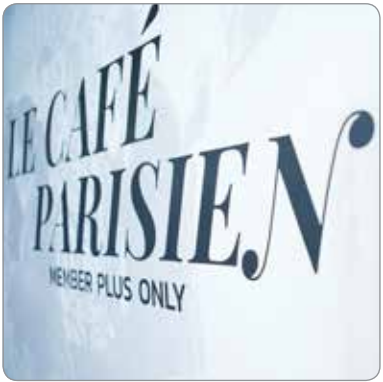
LE CAFÉ PARISIEN VIP MEMBERS ONLY