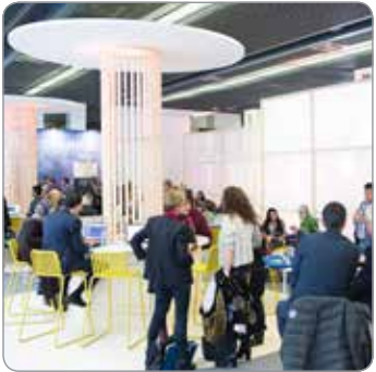
CLUB LOUNGE PREVIEW ROOM - SPEAKERS ONLY