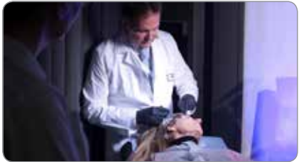
TRAINING LAB & MEETING ROOM